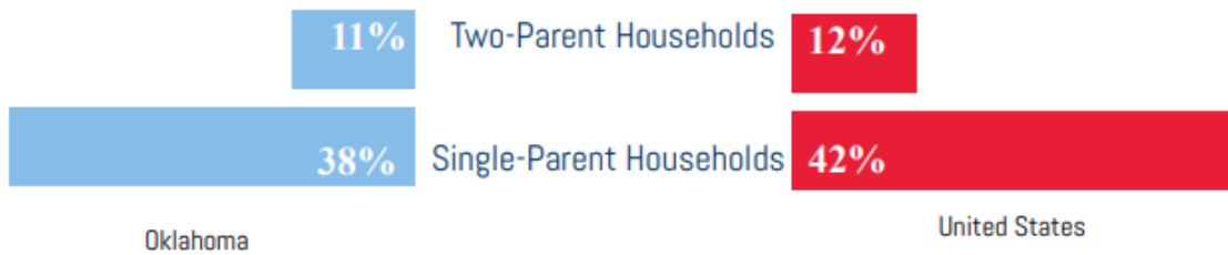
Cost of Infant Care as a Percentage of Income

Most child care facilities require parents to provide diapers for their child. Nationally, 57% of parents experiencing diaper need who rely on child care said they missed an average of four days of school or work in the past month because they didn't have diapers.