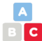
Children Under Age 3 Receiving Federal Child Care Support

Nationwide, 163,126 infants, toddlers, and mothers participate in Early Head Start. 2,751 are from Oklahoma.